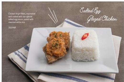
Salted Egg Glazed Chicken Rice