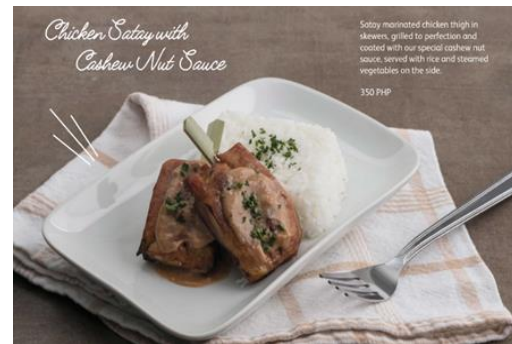
Chicken Satay with Cashew Nut Sauce