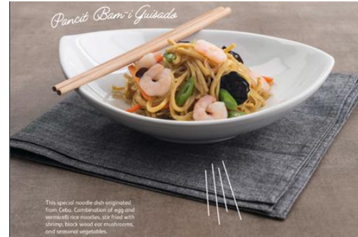
Pancit Bam-I Guisado