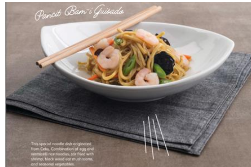
Pancit Bam-I Guisado