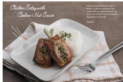
Chicken Satay with Cashew Nut Sauce