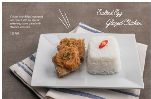
Salted Egg Glazed Chicken Rice