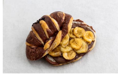
Hazelnut Banana Croissant