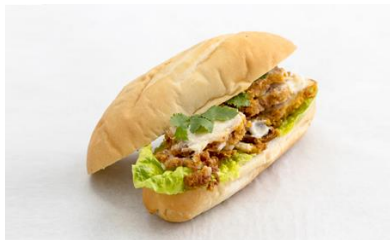
Salted Egg Chicken in Baguette