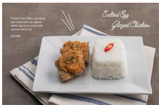
Salted Egg Glazed Chicken Rice