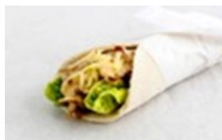
Chicken Inasal Burrito

Slices of grilled chicken with a colorful medley of tomato relish, red cabbage, and lettuce, in freshly baked herb bun.