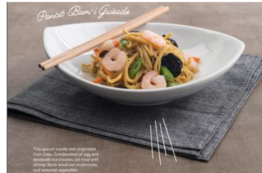
Pancit Bam-I Guisado