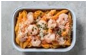
Shrimp Alfonso Pasta

Penne pasta tossed in our creamy Alfonso tomato sauce, topped with shrimp and parmesan cheese.