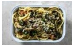
Tuna Pesto Pasta

Penne pasta tossed in our creamy Alfonso tomato sauce, topped with shrimp and parmesan cheese.