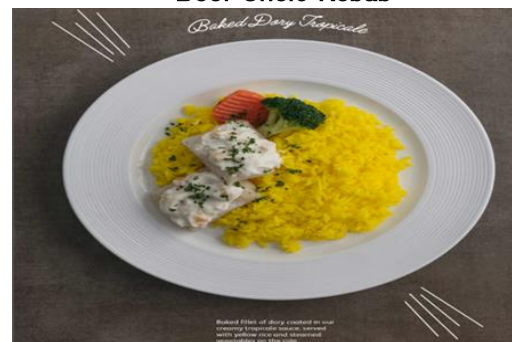
Baked Dory Tropicale