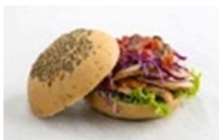
Grilled Chicken Herb Bun

Slices of grilled chicken with a colorful medley of tomato relish, red cabbage, and lettuce, in freshly baked herb bun.