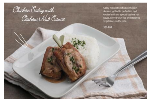
Chicken Satay with Cashew Nut Sauce