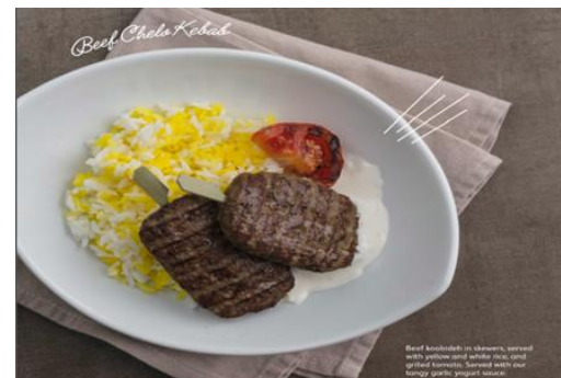
Beef Chelo Kebab