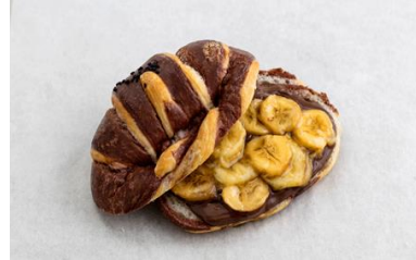
Hazelnut Banana Croissant