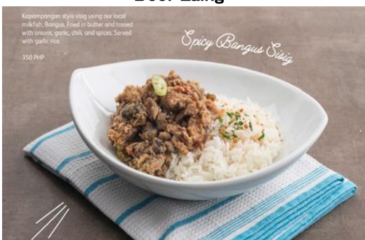
Spicy Bangus Sisig