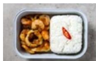
Stir-Fried Mixed Seafood with Salted Egg Sauce

Roasted fillet of dory with our classic Escabeche sauce, served with steamed white rice.