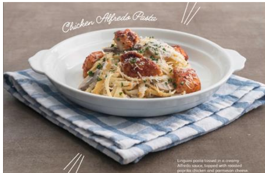
Chicken Alfredo Pasta