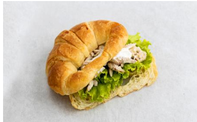
Chicken Caesar Croissant