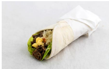
Beef Tapa & Egg Burrito