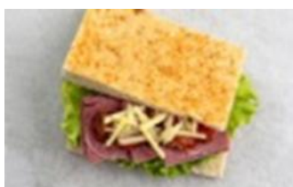
Beef Pastrami in Focaccia

Beef pastrami with tomato relish and lettuce, topped with cheddar cheese, in freshly baked rosemary and parmesan focaccia bread.