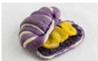
Ube Langka Croissant

Bacolod style chicken inasal, marinated with lemongrass and annatto, sprinkled with cheese and wrapped in a soft tortilla.