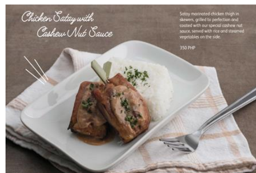
Chicken Satay with Cashew Nut Sauce