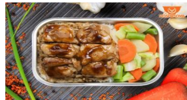
Yoshinoya Chicken Teriyaki