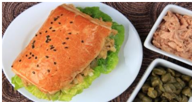
Tuna Capers Crossini