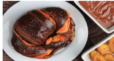
Hazelnut Banana Croissant