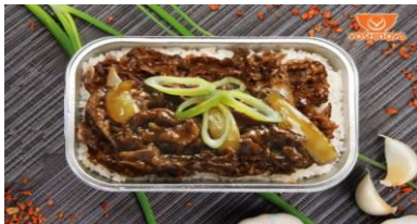
Yoshinoya Beef Bowl