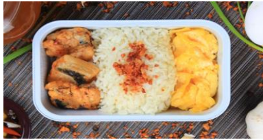
Daing na Bangus