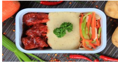
Buffalo Chicken with Mashed Potatoes